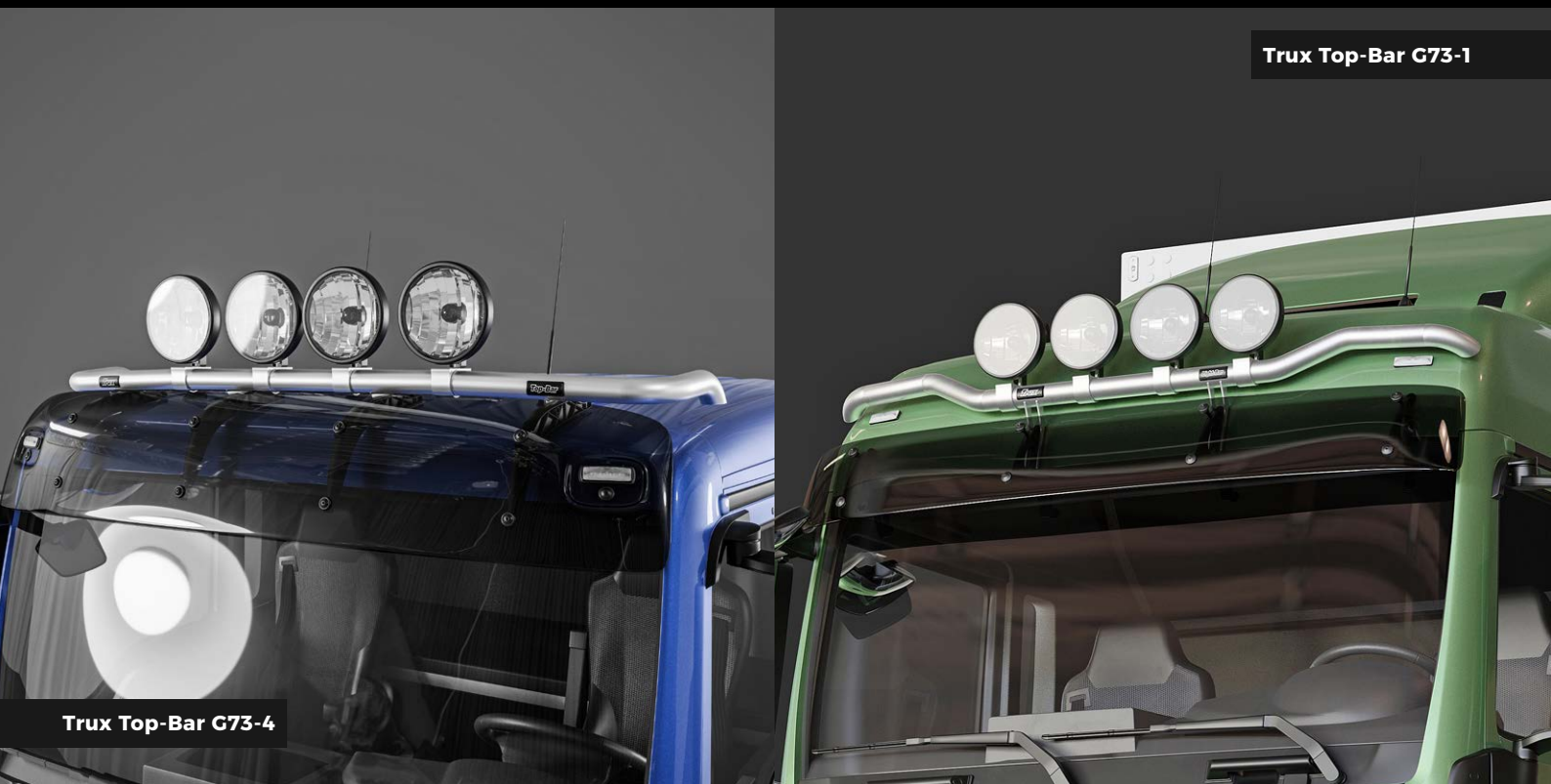
Trux Top-Bar G73-4