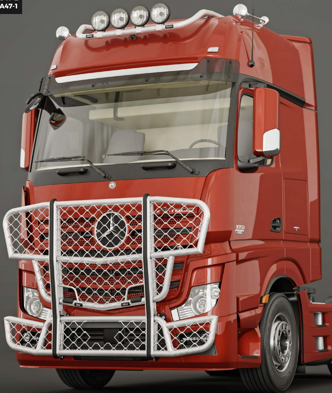
Trux Top-Bar G47-2 Trux Highway A47-1