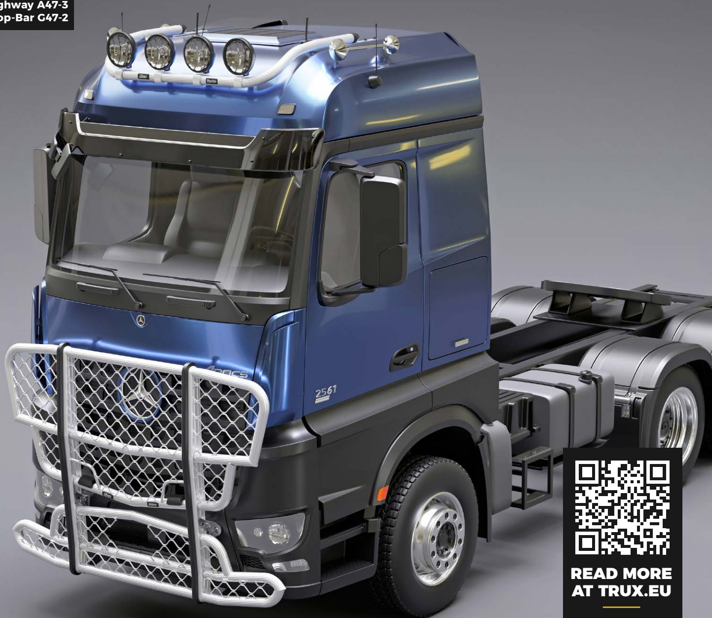
Trux Highway A47-3 Trux Top-Bar G47-2