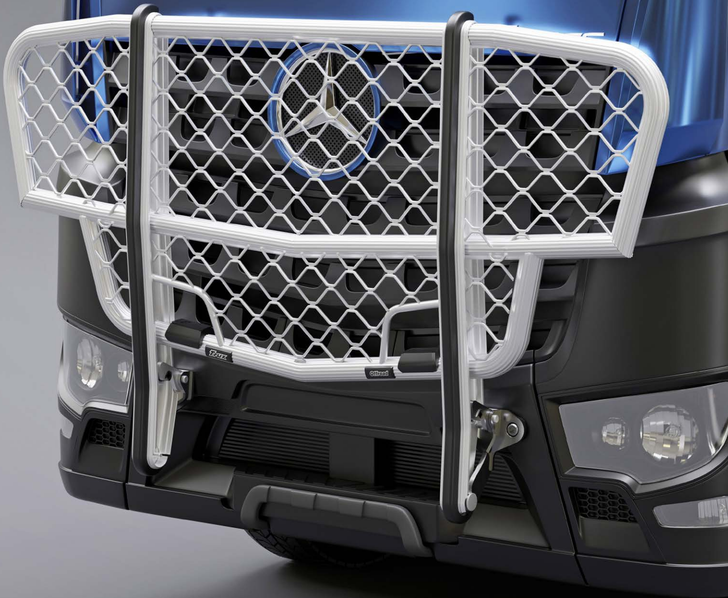
Trux Top-Bar G47-4