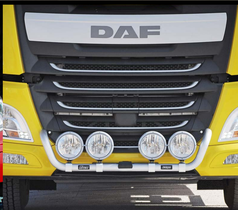
Trux X-Light K63-3