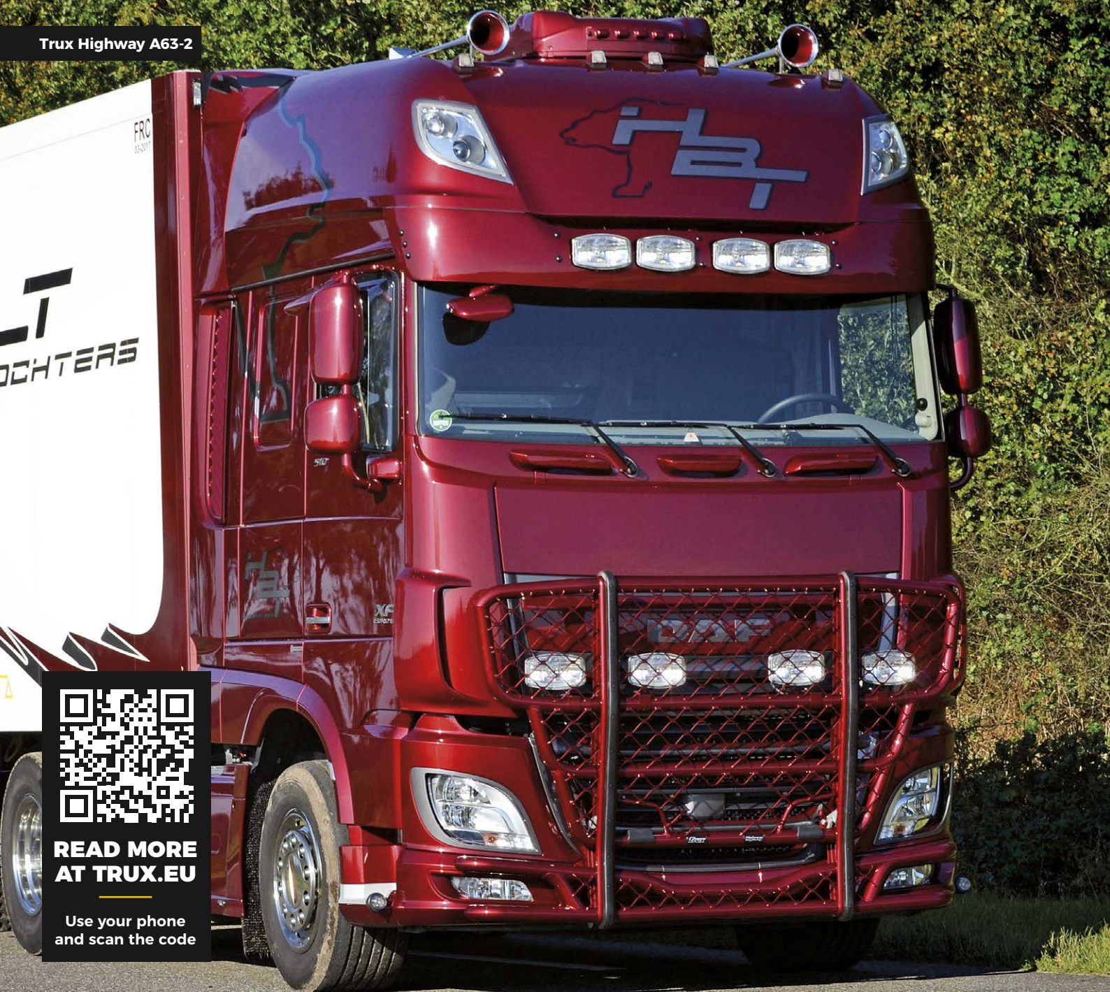
Trux Highway A63-2