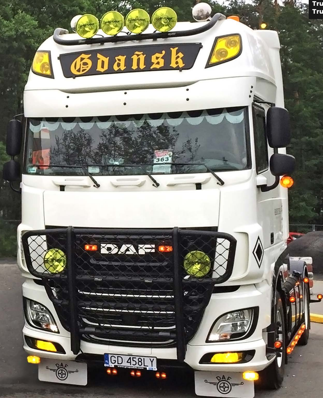
Trux Offroad B63-2 Trux Top-Bar C62-5