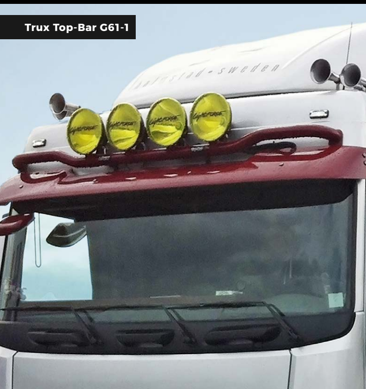
Trux Top-Bar G61-1