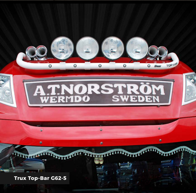
Trux Top-Bar G62-5