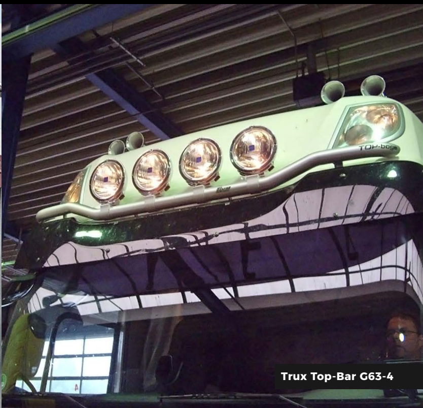
Trux Top-Bar G63-4