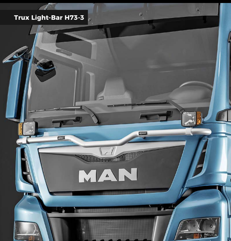
Trux Light-Bar H73-3