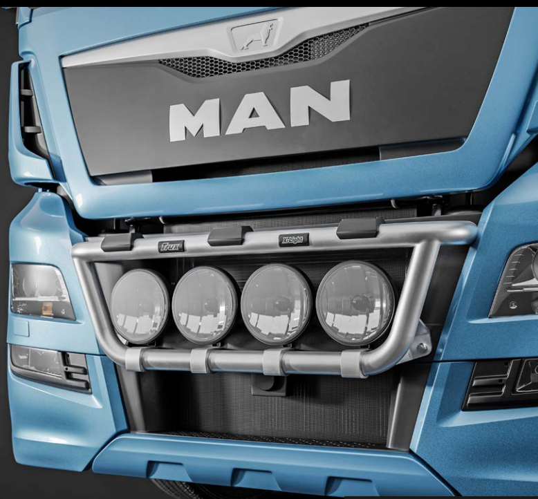
Trux X-Light K75-5