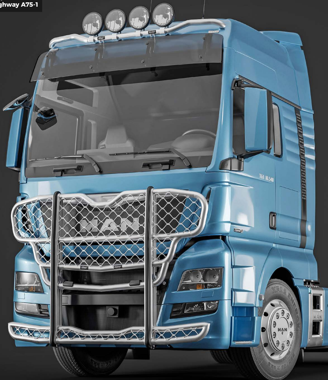
Trux Top-Bar G73-1 Trux Highway A75-1