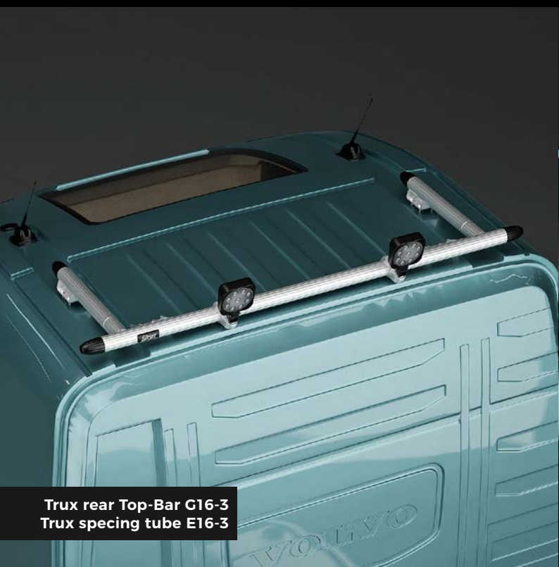
Trux rear Top-Bar G16-3 Trux specing tube E16-3