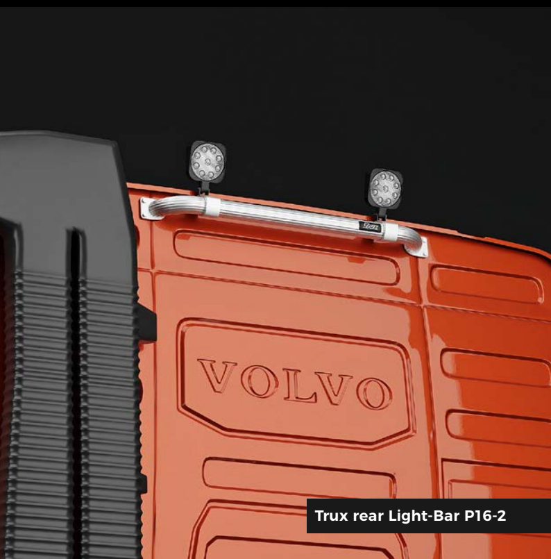
Trux rear Light-Bar P16-2