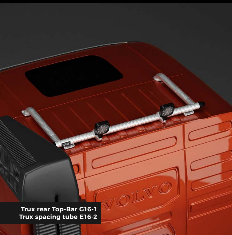
Trux rear Top-Bar G16-1 Trux spacing tube E16-2