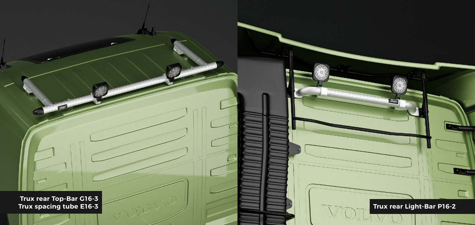
Trux rear Top-Bar G16-3 Trux spacing tube E16-3