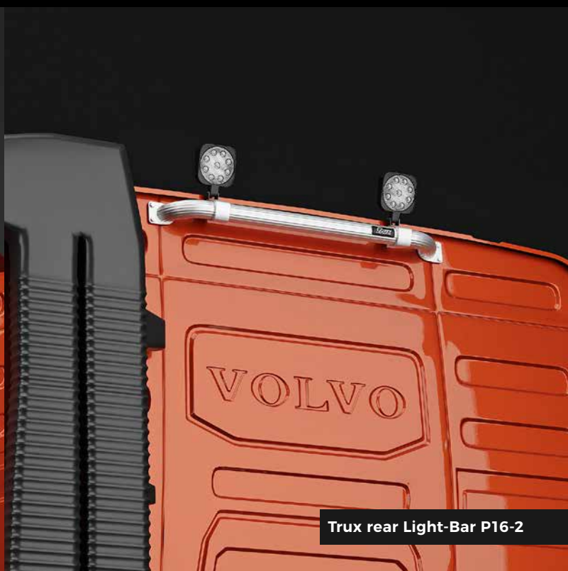
Trux rear Light-Bar P16-2