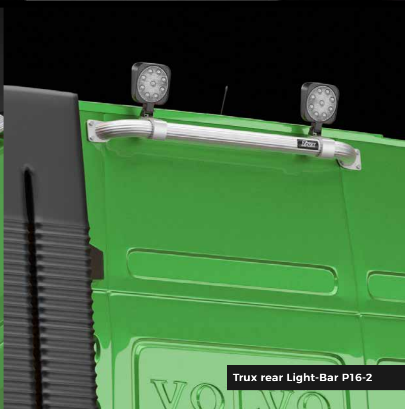
Trux rear Light-Bar P16-2