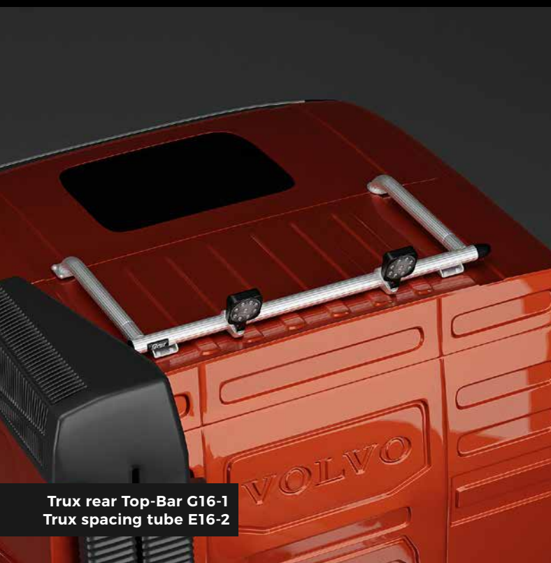
Trux rear Top-Bar G16-1 Trux spacing tube E16-2