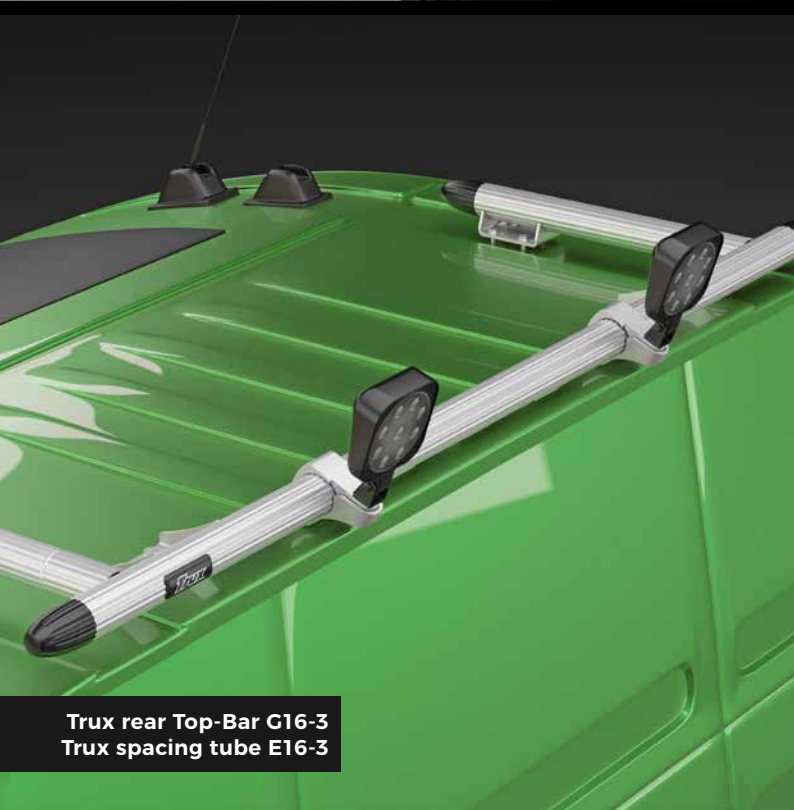
Trux rear Top-Bar G16-3 Trux spacing tube E16-3