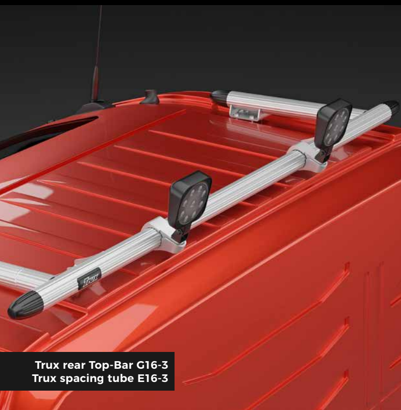
Trux rear Top-Bar G16-3 Trux spacing tube E16-3