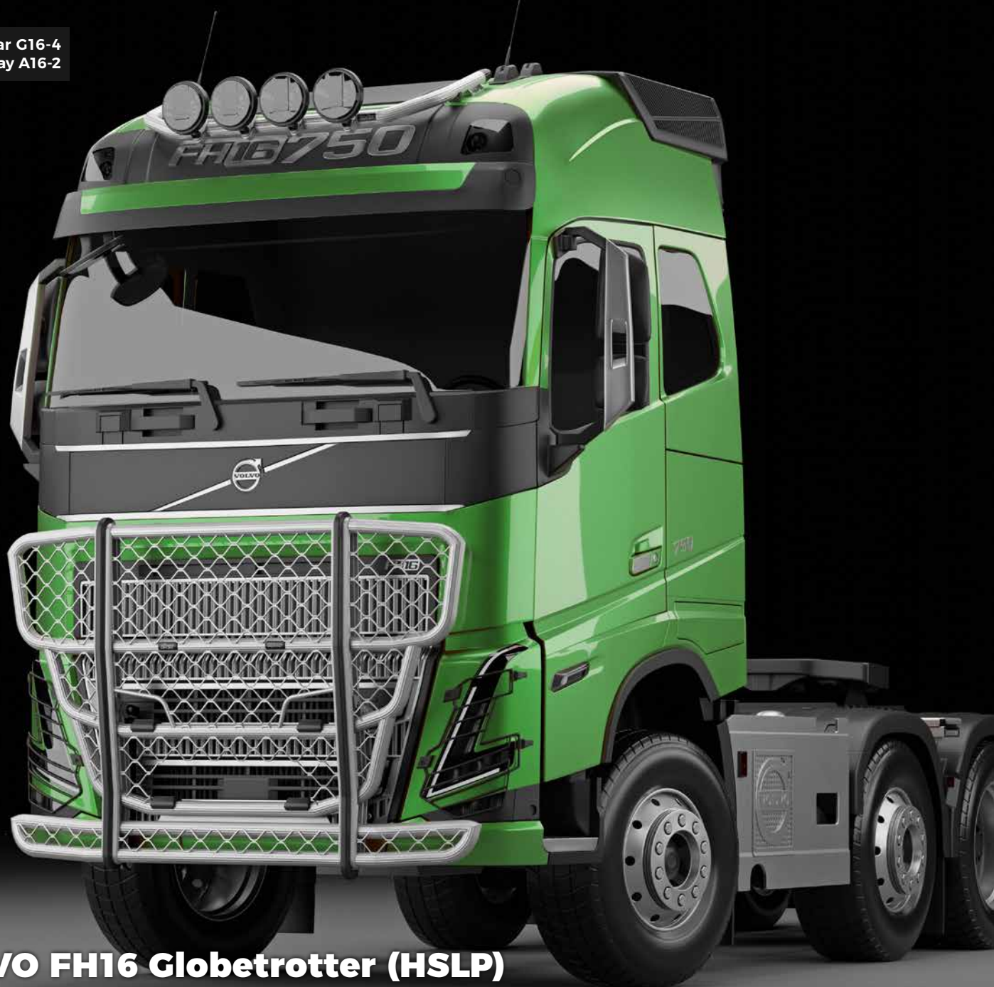
VOLVO FH16 Globetrotter (HSLP)