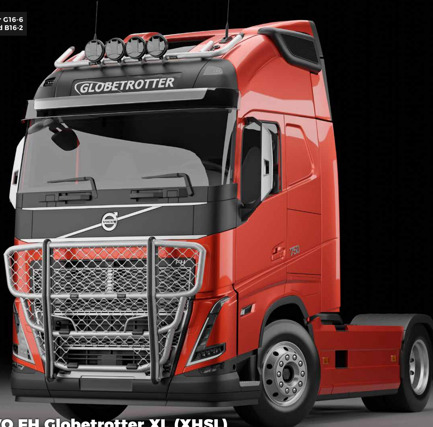
VOLVO FH Globetrotter XL (XHSL)