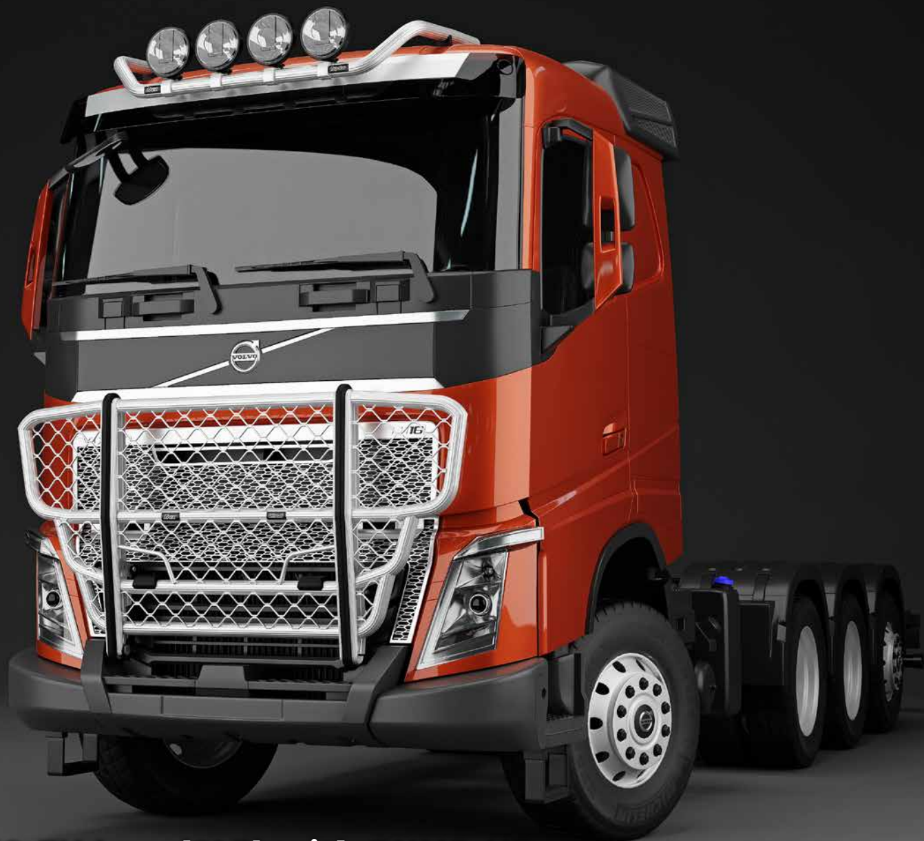
VOLVO FH Low (SLP) with BUMP-HD