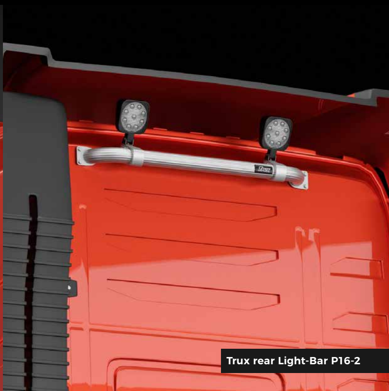
Trux rear Light-Bar P16-2