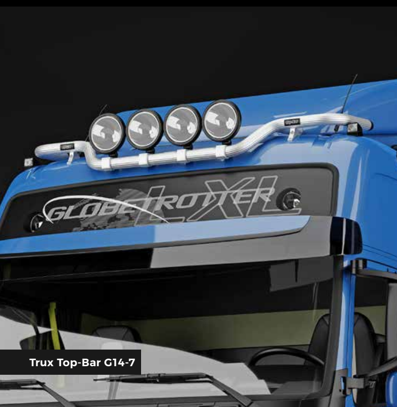
Trux Top-Bar C14-7