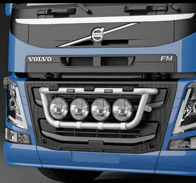
Trux X-Light K16-5