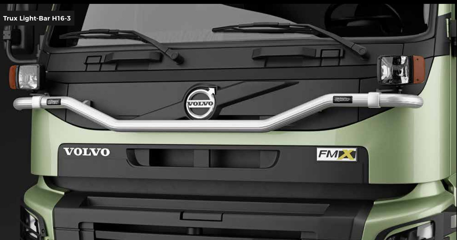
Trux Light-Bar H16-3