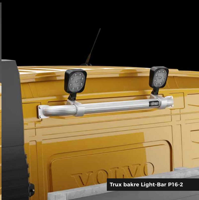
Trux bakre Light-Bar P16-2