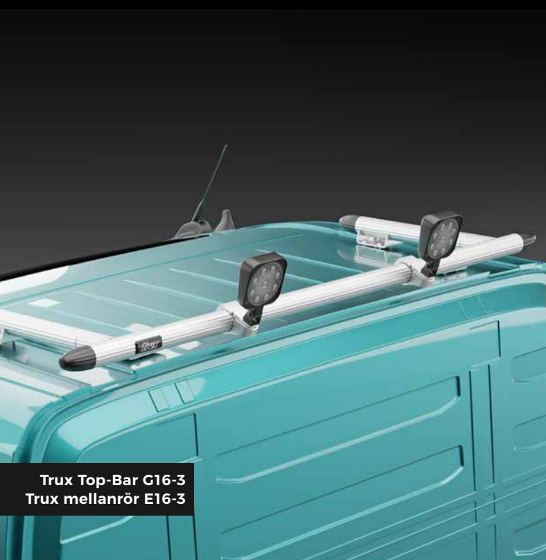
Trux Top-Bar G16-3 Trux mellanrör E16-3