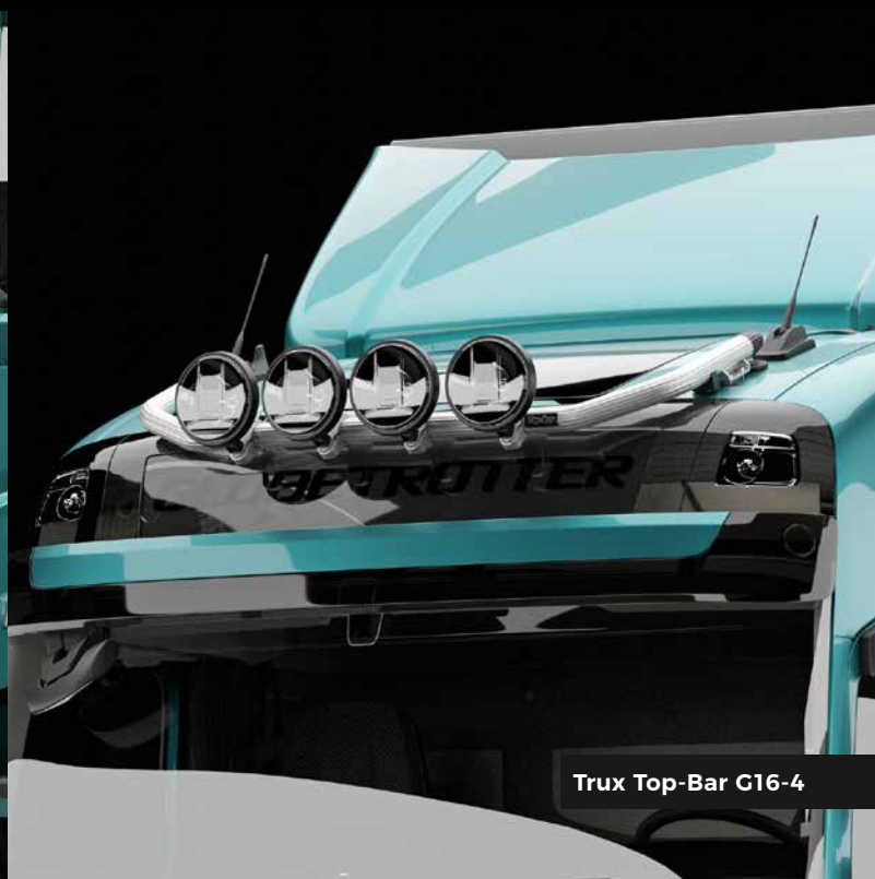
Trux Top-Bar G16-4