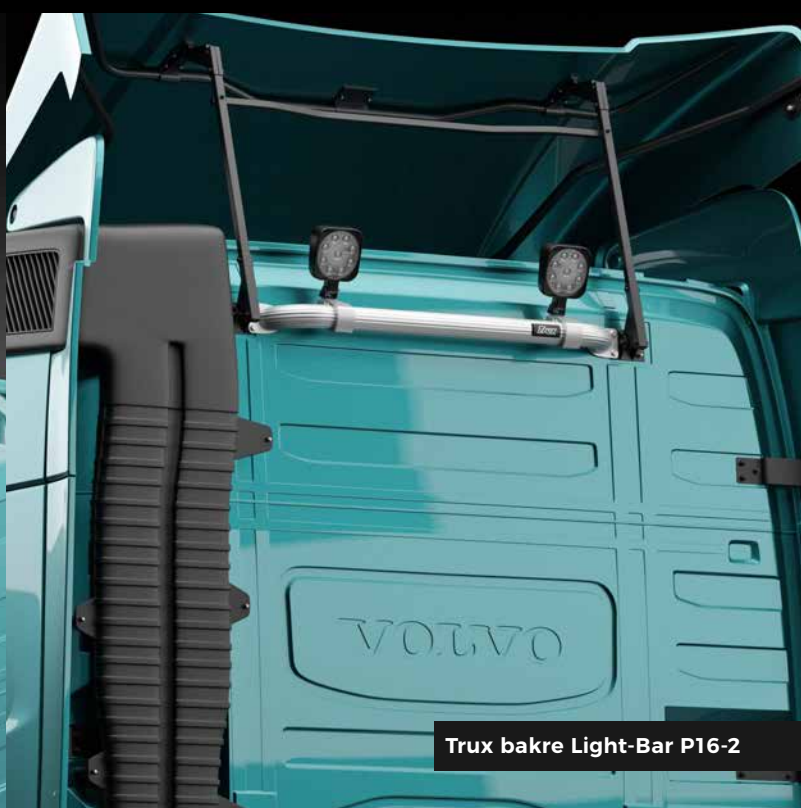
Trux bakre Light-Bar P16-2