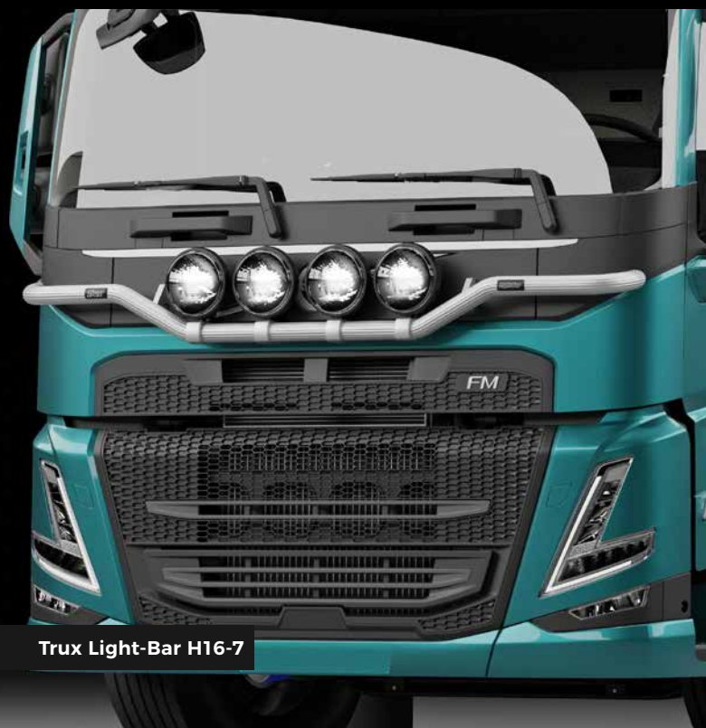
Trux Light-Bar H16-7