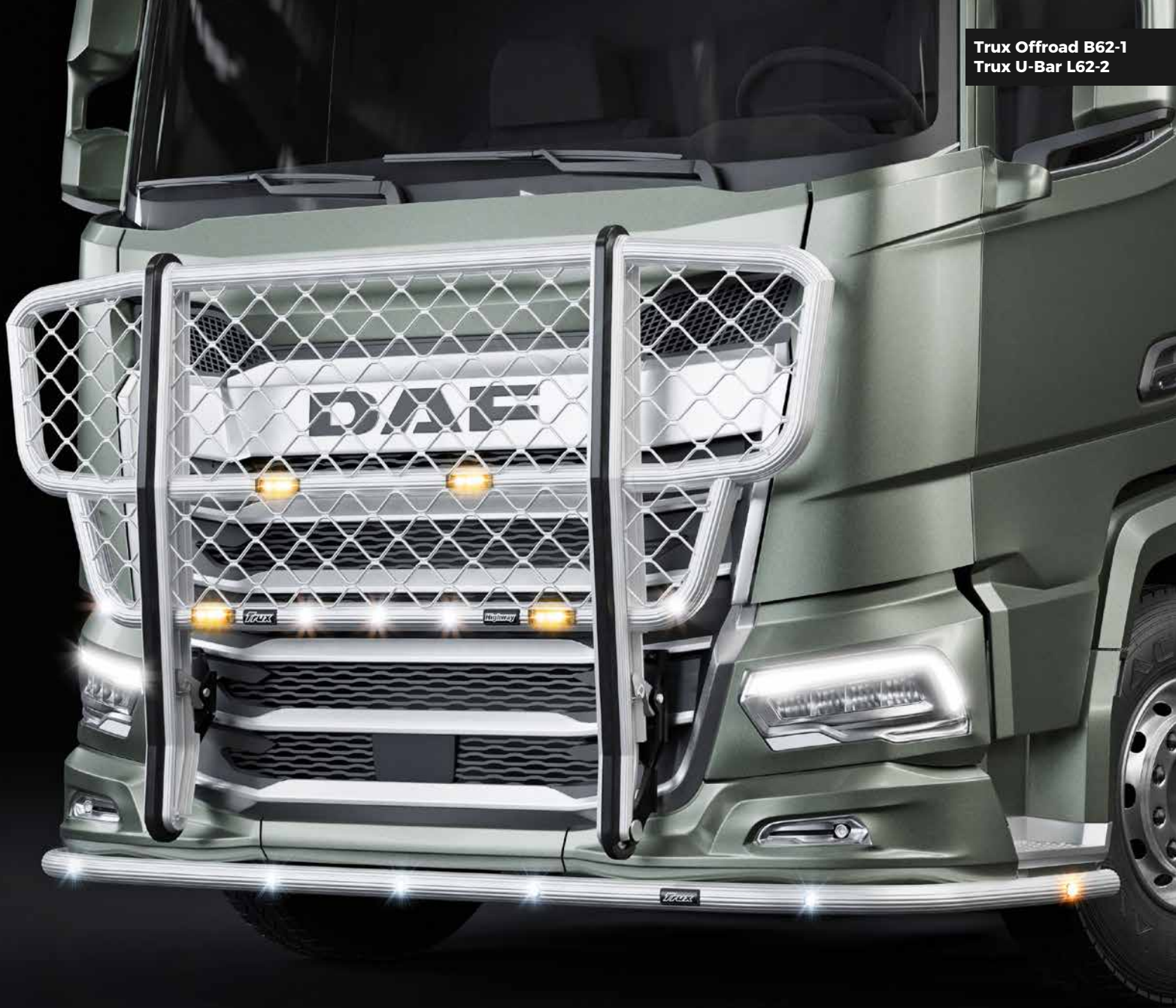
Trux Offroad B62-1 Trux U-Bar L62-2