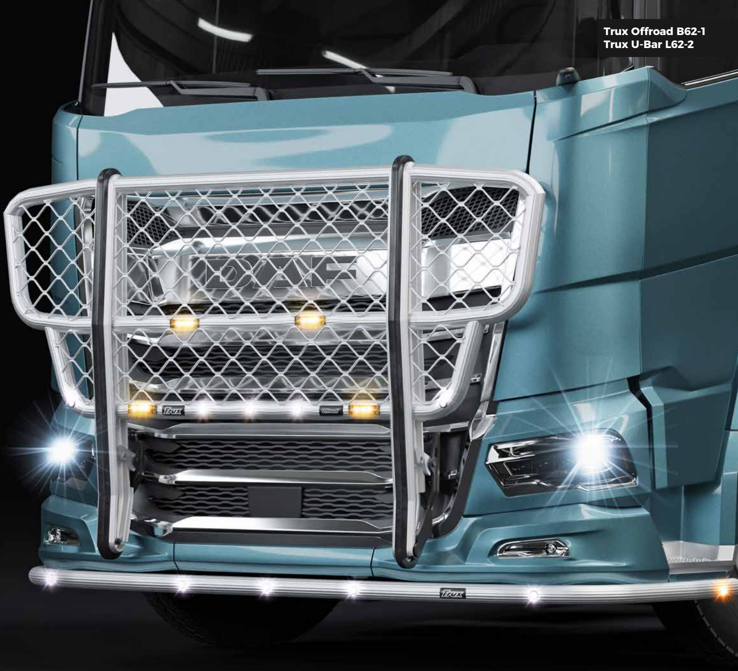
Trux Offroad B62-1 Trux U-Bar L62-2