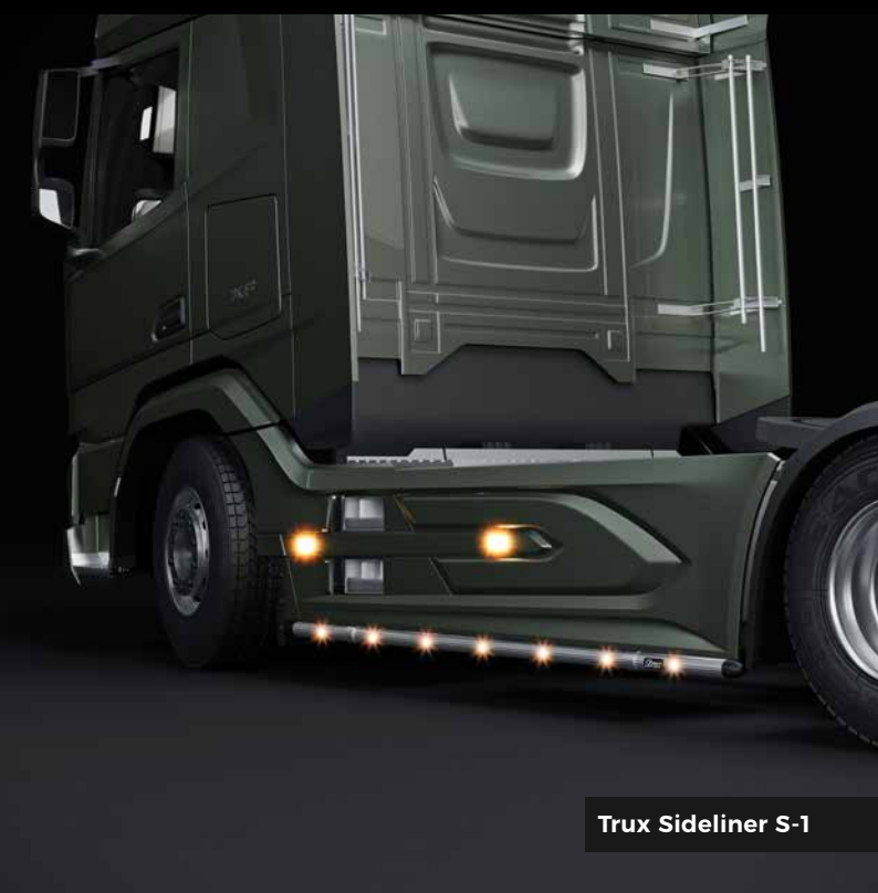
Trux Sideline S-1