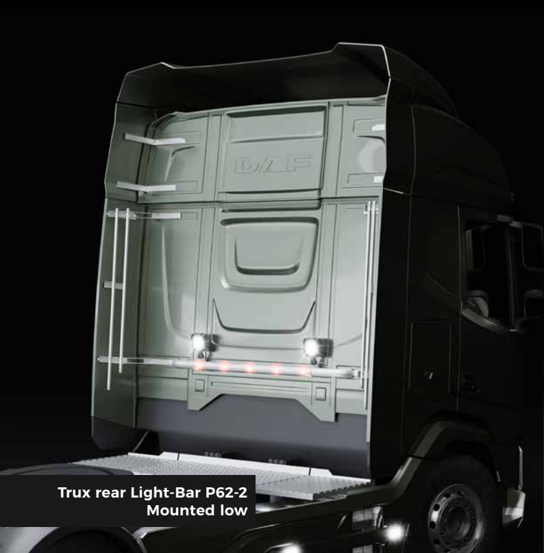
Trux rear Light-Bar P62-2 Mounted low