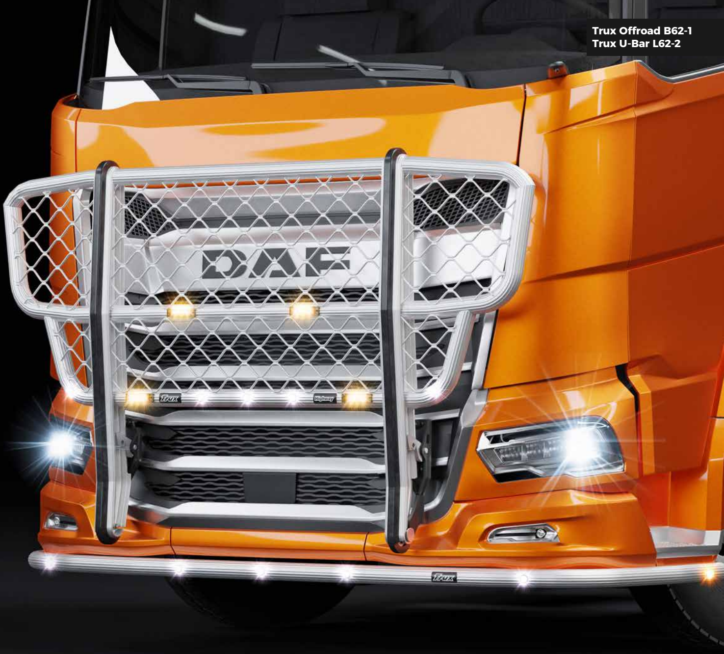
Trux Offroad B62-1 Trux U-Bar L62-2