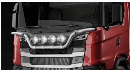
Lights and clamps are not included!