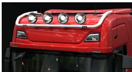
Lights and clamps are not included!

Not for cabs with roof air deflector height 65 cm