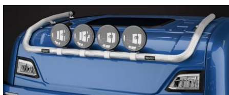
Lights and clamps are not included!

Not for cabs with roof air deflector height 65 cm