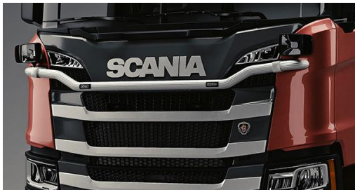
Lights and clamps are not included!