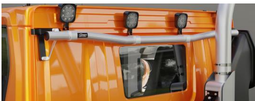
Lights and clamps are not included!