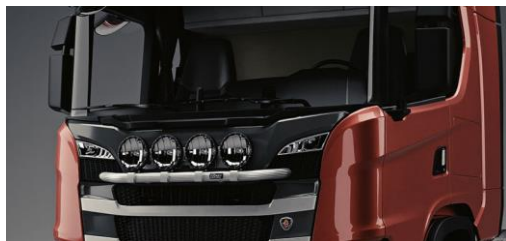
Lights and clamps are not included!