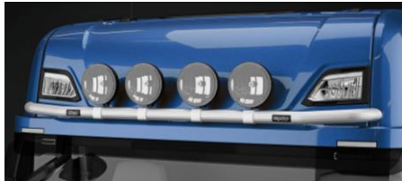
Lights and clamps are not included!