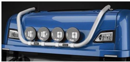
Lights and clamps are not included!