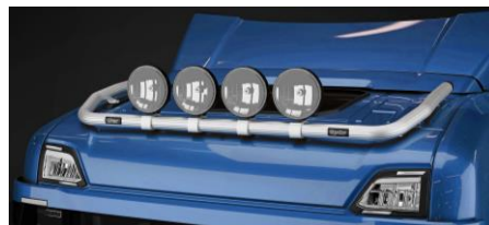
Lights and clamps are not included!