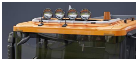
Lights and clamps are not included!

with sun visor and without integrated auxiliary lamps