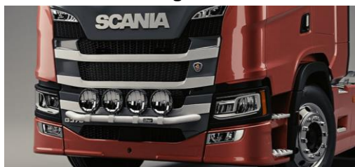
Lights and clamps are not included!