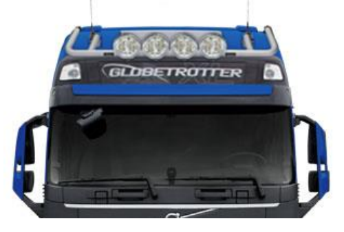
Lights and clamps are not included!