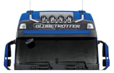
Lights and clamps are not included!