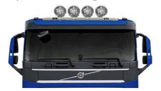
Lights and clamps are not included!