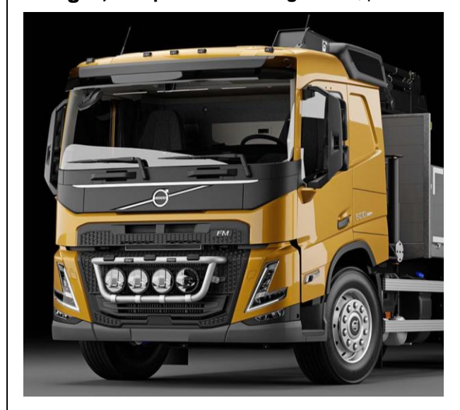
Lights not included!

Airflow K16-5 9 500, Smooth profile K16-5S 9 500,