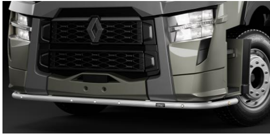
LED-lights not included!