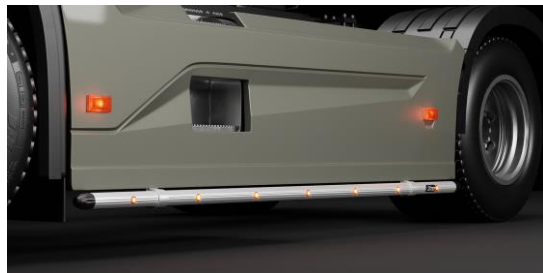
LED-lights not included!