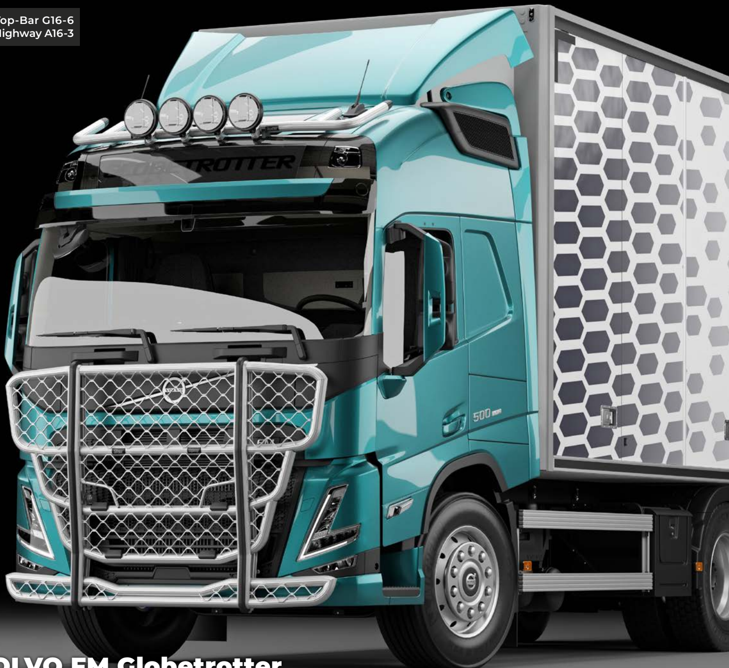
VOLVO FM Globetrotter