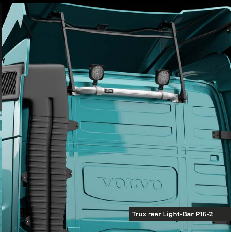
Trux rear Light-Bar P16-2