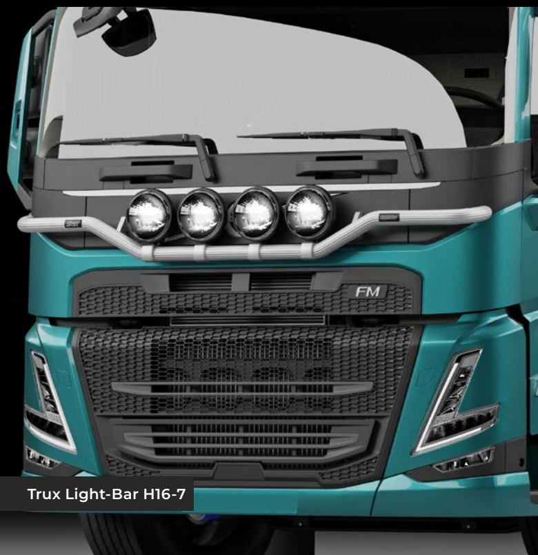
Trux Light-Bar H16-7