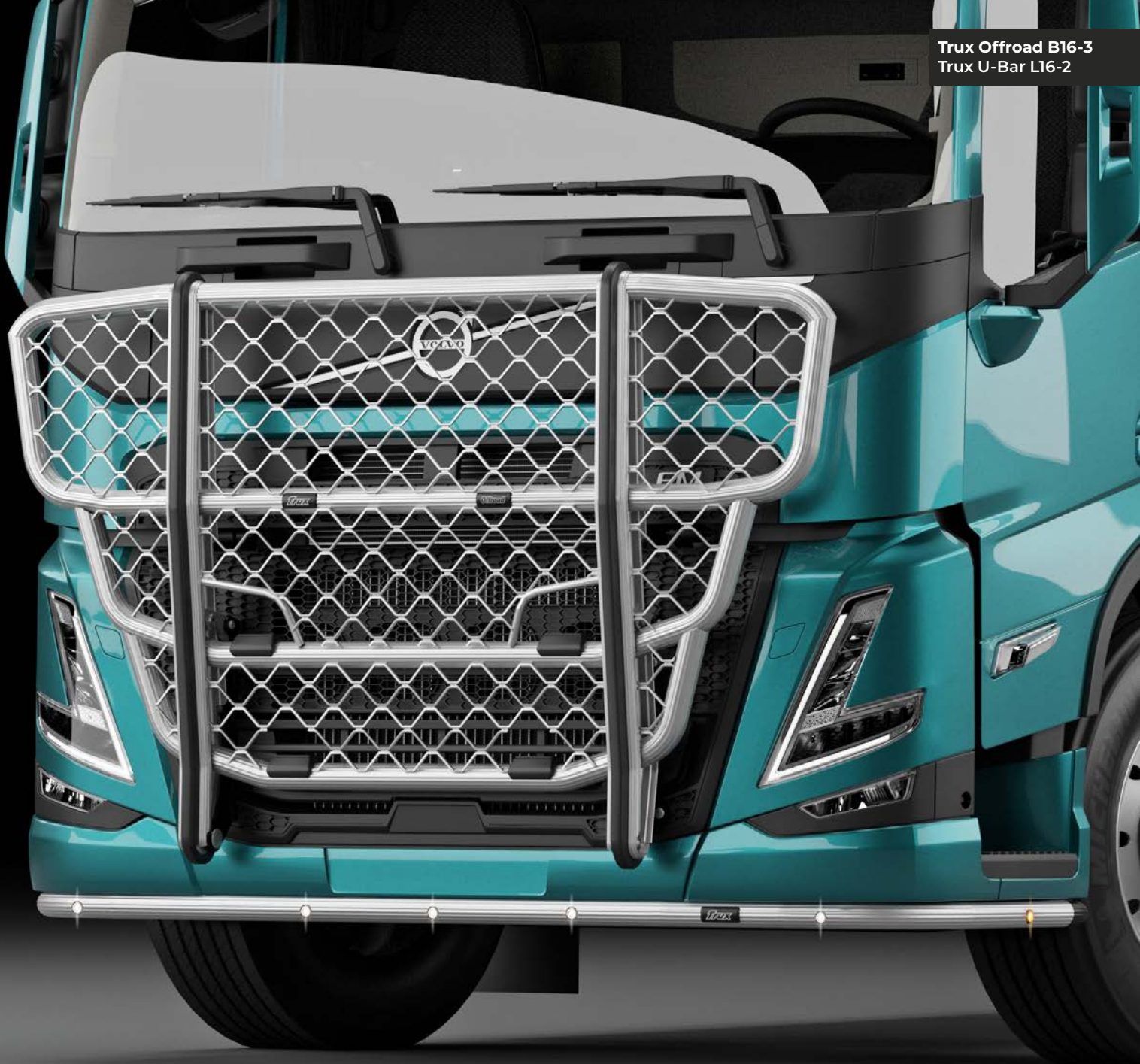
Trux Offroad B16-3 Trux U-Bar L16-2