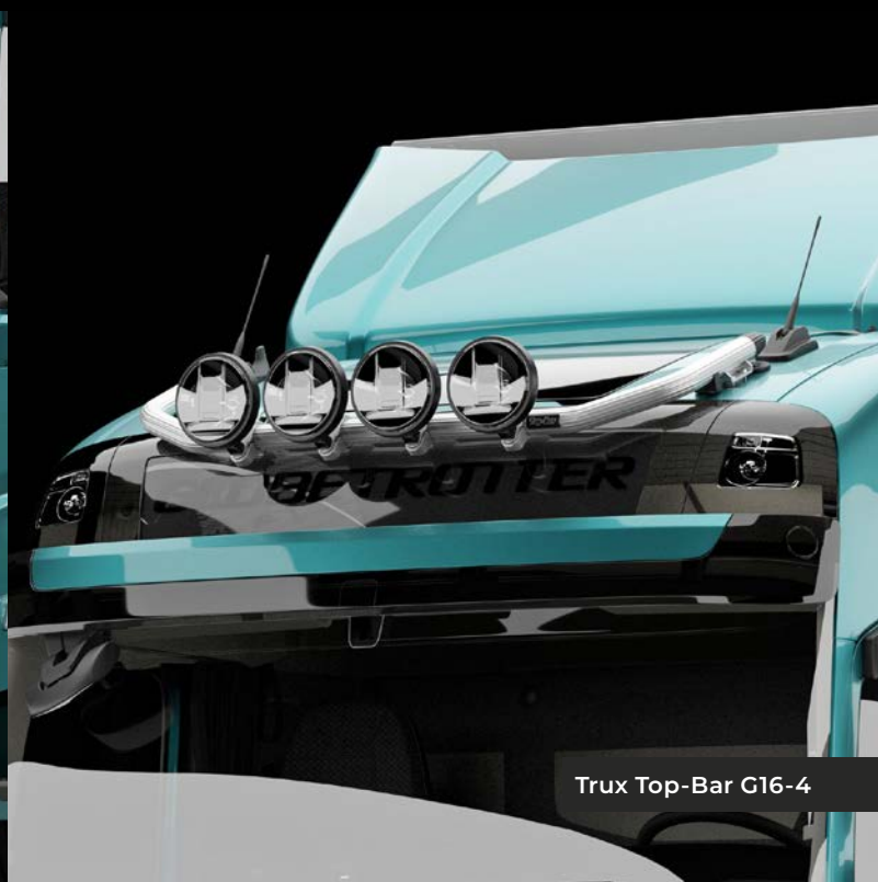
Trux Top-Bar G16-4