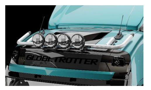
Lights and clamps are not included!