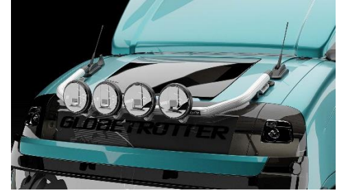
Lights and clamps are not included!

Low model, 6 800,for Sleep cab (SLP) Airflow G16-7 Smooth profile G16-7S 6 800,-