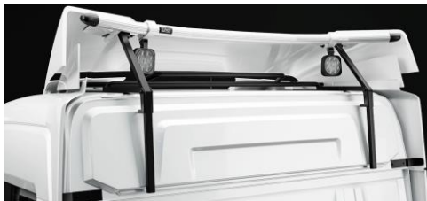
Lights and clamps are not included!