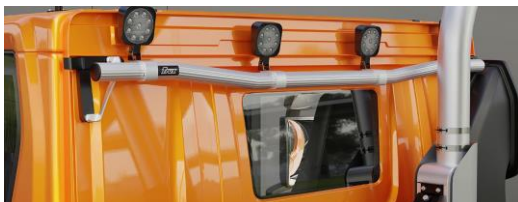
Lights and clamps are not included!