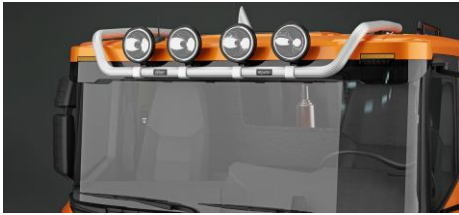
Lights and clamps are not included!