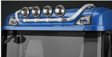
Lights and clamps are not included!