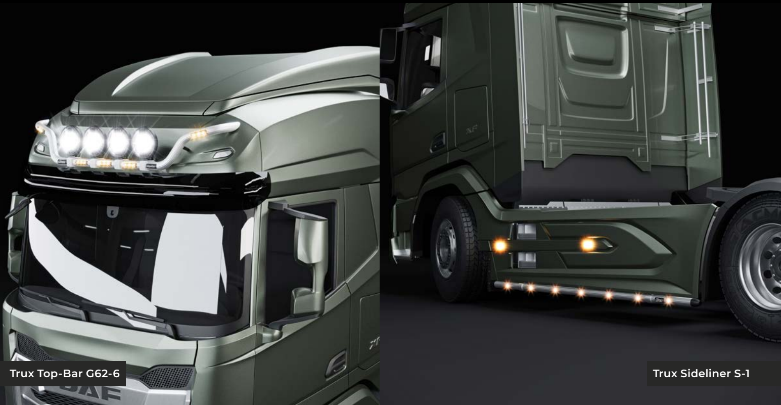
Trux Top-Bar G62-6