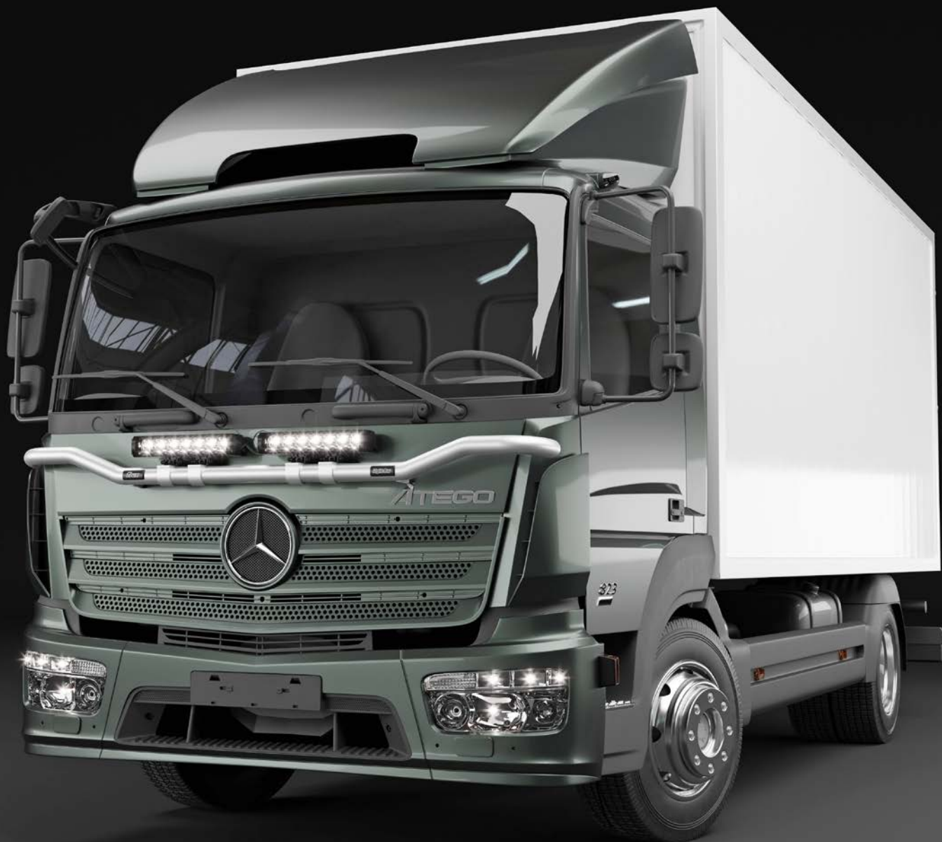
Trux spacing tube E43-3 Trux Top-Bar G43-3