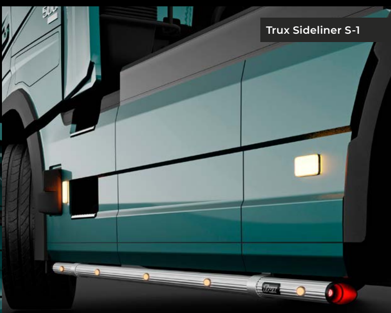
Trux Sideline S-1