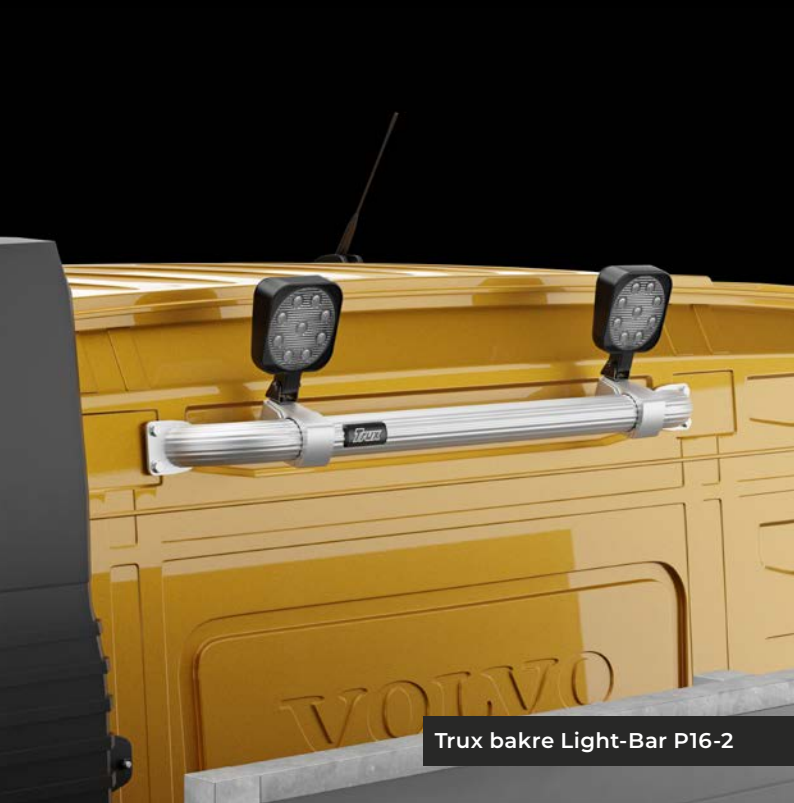
Trux bakre Light-Bar P16-2